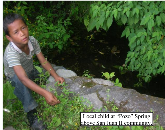
Local child at "Pozo" Spring above San Juan II community.