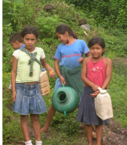
Children of San Juan II fetching water from the spring

“My name is Johanna Butter de Barillas, my family owns an small coffee plantation up in the mountains of the state of Usulután, located on the east part of El Salvador, next to it, there is a community " San Juan 2" of about 80 families who lack electricity, water... The nearest towns are Berlin and Alegría. There is no paved road that leads to the community, the only access road is a dirt one in very poor condition, therefore there is no public transportation; they have to walk 4 miles to get to the nearest town. The only water available within a 4 mile range, is from a couple of water holes that are located inside [and adjacent to] our property, about 1 mile from the main dirt road... We think that the water could be transported through a pipeline to the main dirt road and from there take it to their homes, by gravity. But due to lack of money on our side, we have not been able to fulfill our dream to supply water to the people in the small village of San Juan 2... That is why we are asking for your help.”