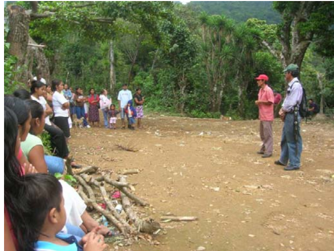
Community meeting in San Juan II welcoming possibility of future WEFTA collaboration for a spring-fed, gravity water system.